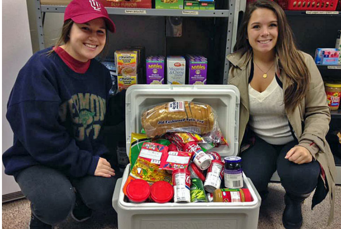
Volunteers at the Crimson Cupboard.

IU Student Government donated $100,000 to the on-campus food pantry, Crimson Cupboard, and to students financially affected by the coronavirus pandemic. If you need financial assistance you can submit an application . (Read the IDS article for details.)